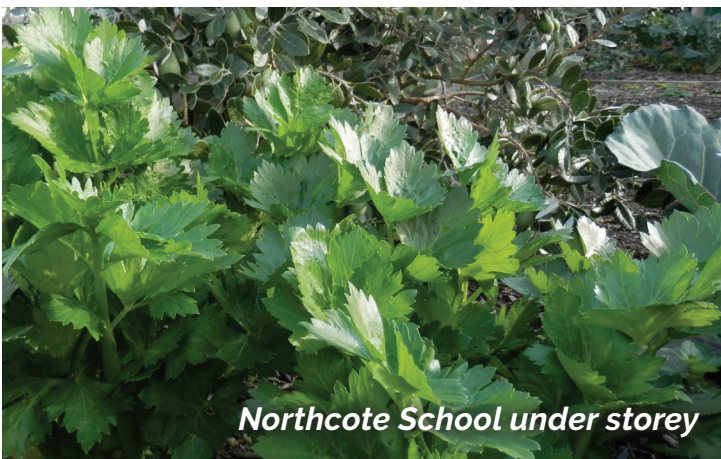
Northcote School under storey

Northcote School, thanks to grandparent Tahi, have a thriving vegetable garden under the trees. They've grown celery cabbages, broccoli and cauliflowers .