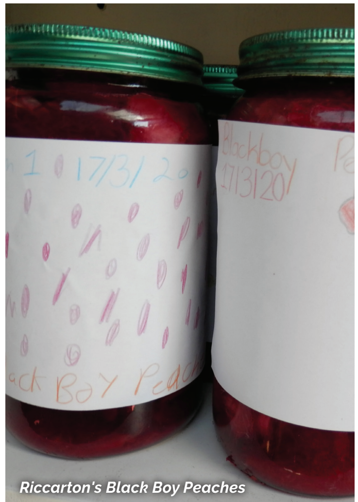
Riccarton's Black Boy Peaches