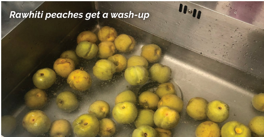
Rawhiti peaches get a wash-up