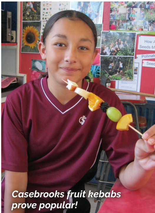
Casebrooks fruit kebabs prove popular!