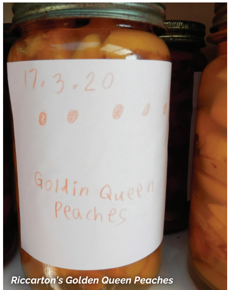
Riccarton's Golden Queen Peaches