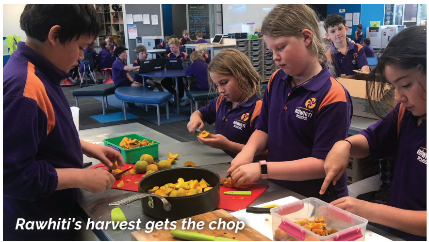
Rawhiti's harvest gets the chop