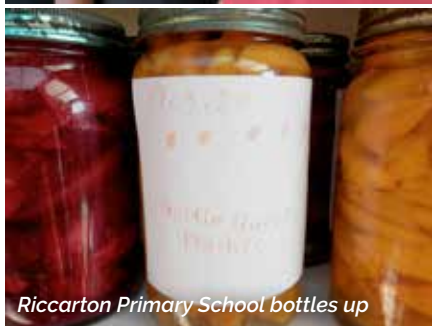
Riccarton Primary School bottles up