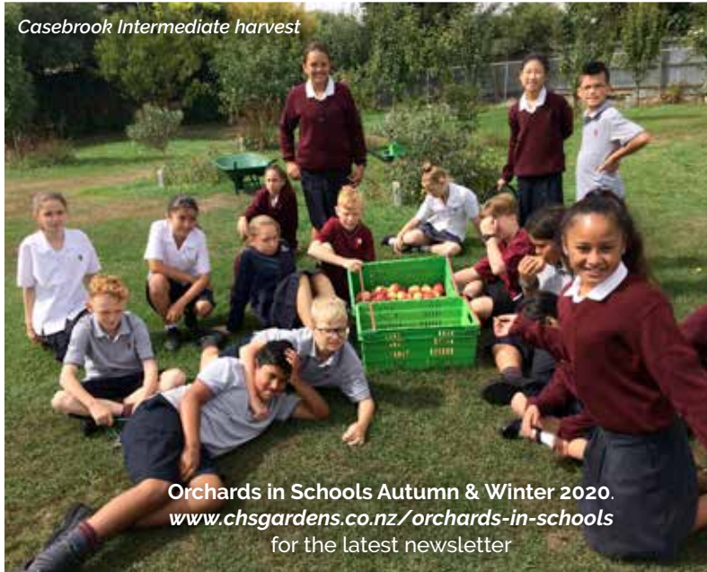
Casebrook Intermediate harvest

Orchards in Schools Autumn & Winter 2020. www.chsgardens.co.nz/orchards-in-schools for the latest newsletter