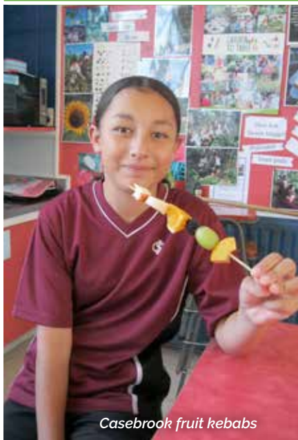
Casebrook fruit kebabs

366 6937 www.chsgardens.co.nz office@chsgardens.co.nz @CanterburyHorticulturalSociety