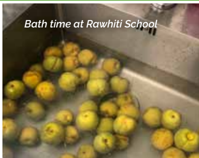
Bath time at Rawhiti School