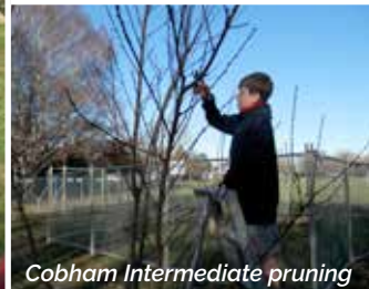
Cobham Intermediate pruning

Orchards in Schools Autumn & Winter 2020. www.chsgardens.co.nz/orchards-in-schools for the latest newsletter