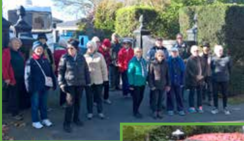
July sees the Ramblers exploring along the Heathcote River and the inner City Lanes.

Photos show Ramblers in front 'Heathfield' Heathfield Ave and a car with Autumn decorating seen while out walking.