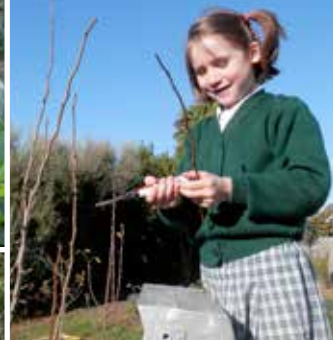
Burnside Primary School gets a grip on pruning