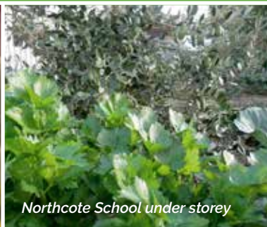
Northcote School under storey