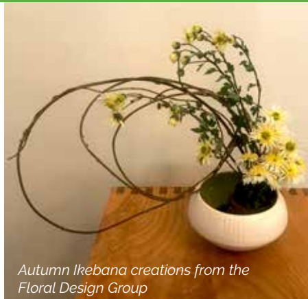
Autumn Ikebana creations from the Floral Design Group