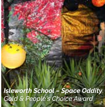
Isleworth School – Space Oddity Gold & People's Choice Award

You can see all the photos and results on our web-page: www.chsgardens.co.nz/2018-results