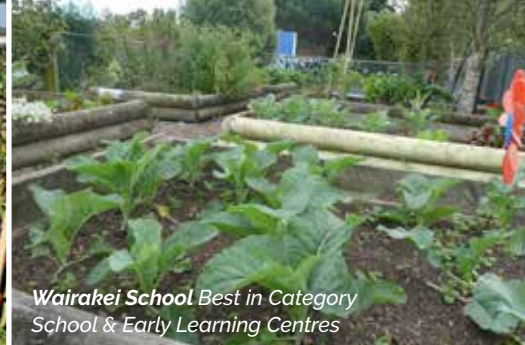
Wairakei School Best in Category School & Early Learning Centres