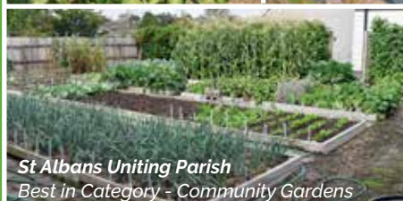
St Albans Uniting Parish Best in Category - Community Gardens