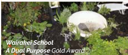
Wairakei School A Dual Purpose Gold Award