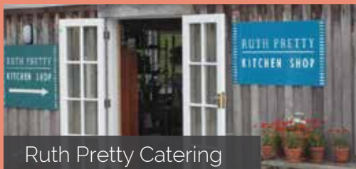
Ruth Pretty Catering