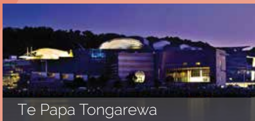
Te Papa Tongarewa