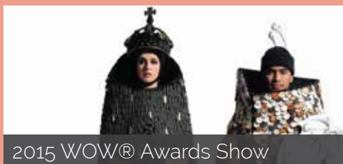
2015 WOW® Awards Show