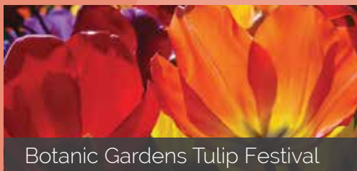
Botanic Gardens Tulip Festival